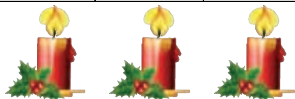
Third Sunday of Advent